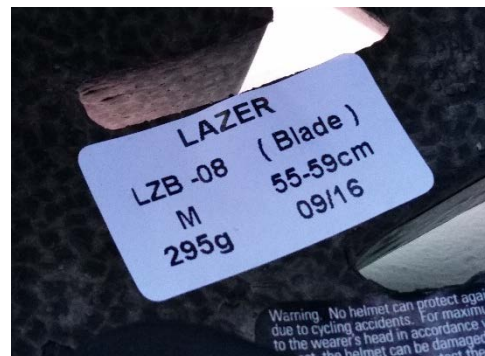
Manufacturing Date Location